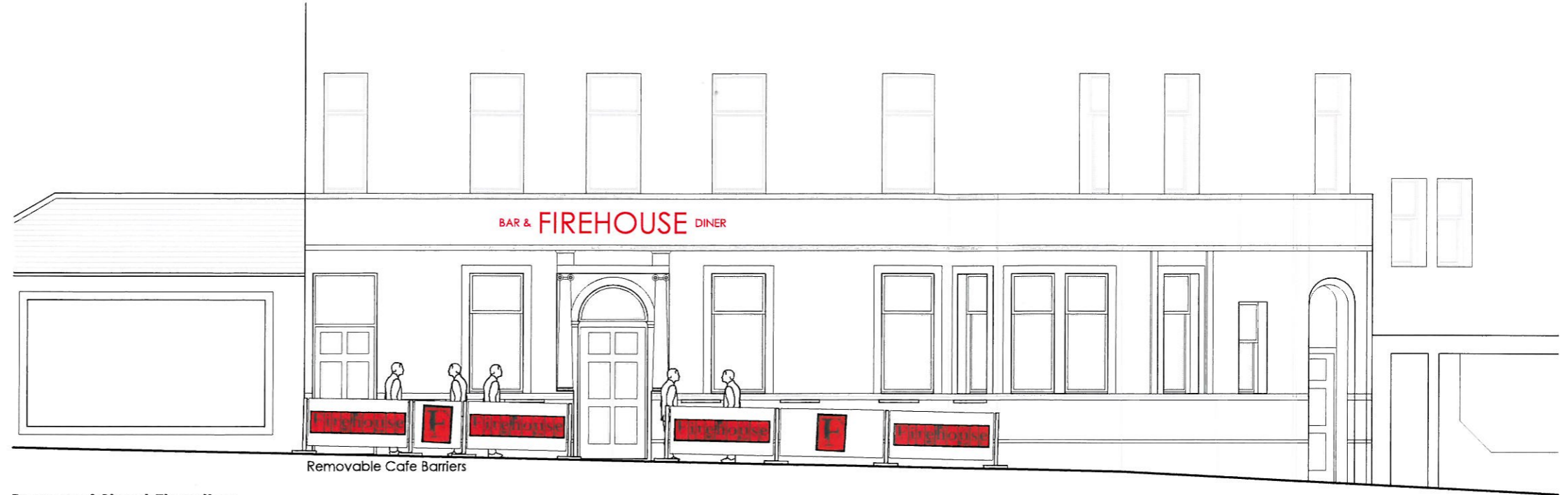
Proposed Street Elevation Scale 1:100